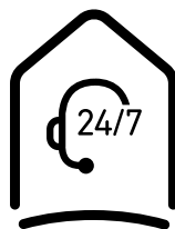
MAINTENANCE EMERGENCY CARE