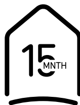
FUTURE PRICE GUARANTEE